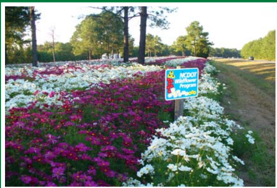
DOT Wildflower Project—Cosmos Bipinnatus